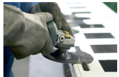
Steel sheet and welding seams